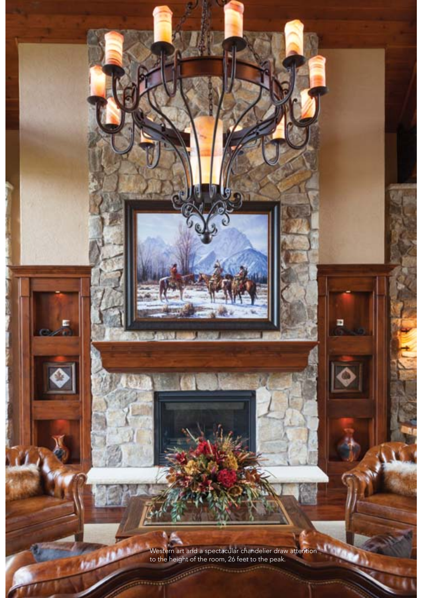
Western art and a spectacular chandelier draw attention to the height of the room, 26 feet to the peak.

This page, from top: The open floor plan, with its soaring ceiling, allows for several conversation areas. Chris Burkett deals in Western-style furnishings at his Colorado Classics store in Valley Junction, and the home showcases many of the pieces. • Artful pieces flank the floor-to-ceiling stone fireplace.