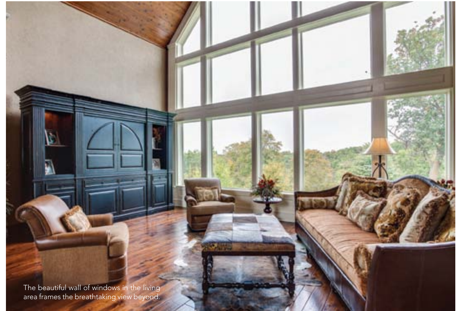
The beautiful wall of windows in the living area frames the breathtaking view beyond.

Huge windows everywhere soak in spectacular views. “The views are wonderful,” Vicki says. “Truly, it reminds me of my native Pennsylvania. I love it. Plus, there are lots of wildlife to observe, such as coyotes, foxes, and deer.” She is a nurse by training and is a medical sales consultant. She attends surgeries at various hospitals in central Iowa when her company’s products, such as pacemakers, are being used.