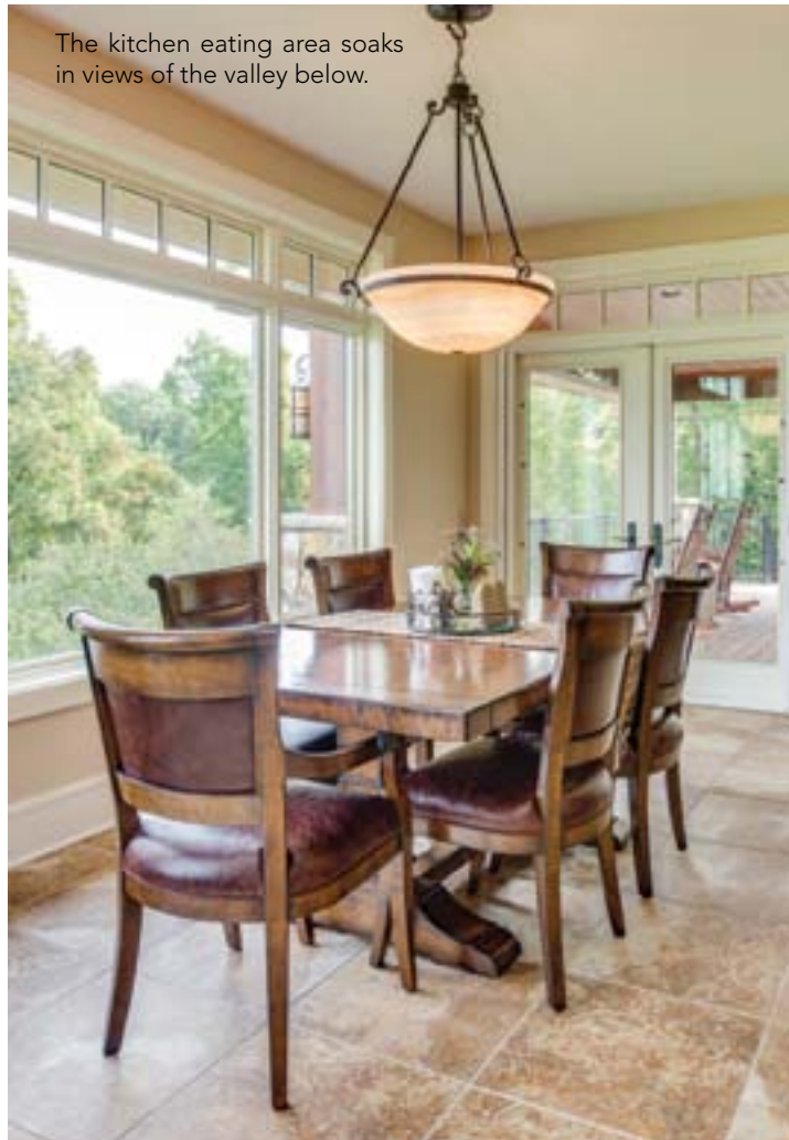
The kitchen eating area soaks in views of the valley below.