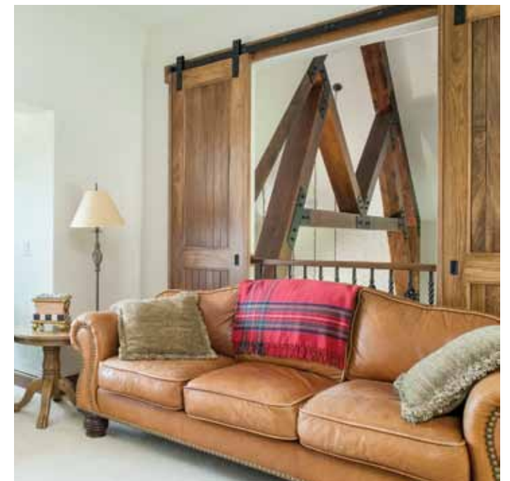
This spread, clockwise from top: The home’s distinctive rustic lodge exterior gains its texture from cedar siding, shakes, and stone from Telluride, Colorado. • A second-floor loft, complete with sliding barn doors, overlooks the living area and showcases the room’s massive beams. • The dining room’s rich wood look comes from a wall of built-in cabinetry and short beams to carry out the timbered look.