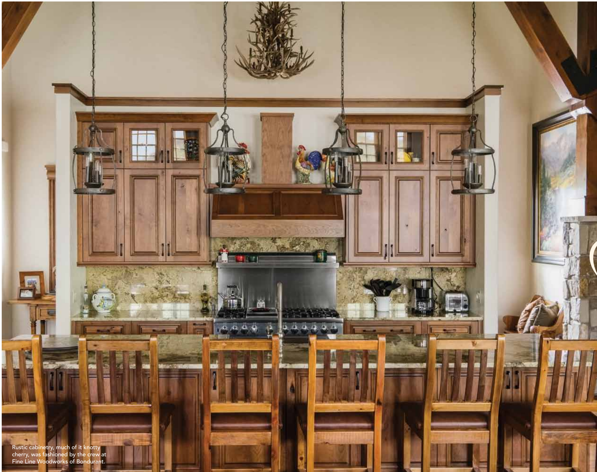
Rustic cabinetry, much of it knotty cherry, was fashioned by the crew at Fine Line Woodworks of Bondurant.